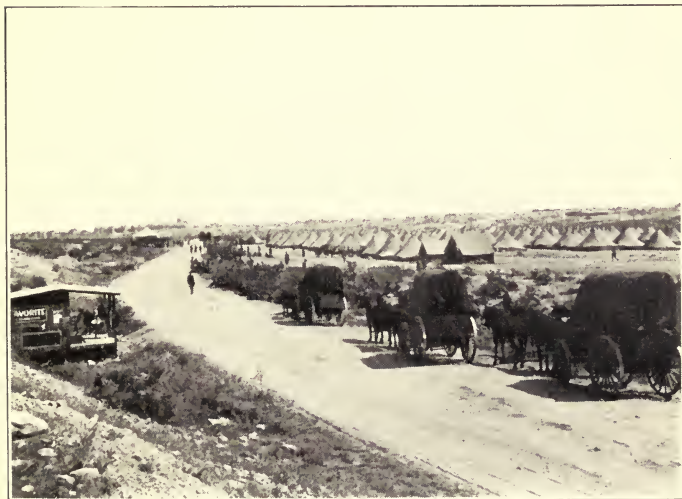
THE PARADE HALTS